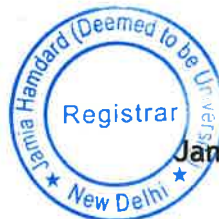
Registrar Jamia Hamdard, New Delhi